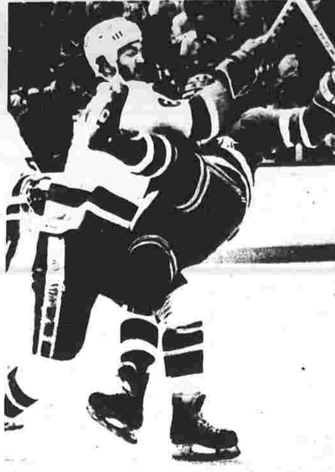
The puck is all but ignored as New York Islander defenseman Ken Morrow lays solid check on New York Rangers' Ulf Nilsson in NHL clash in Unoniale.