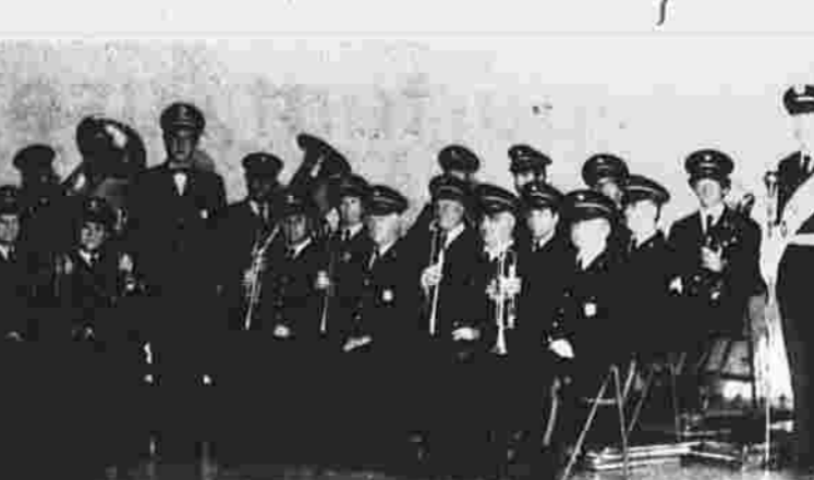
The Governor's Foot Guard Band will give a concert April 8 at 7:30 p.m. in the auditorium of Iling Junior High School, Manchester.